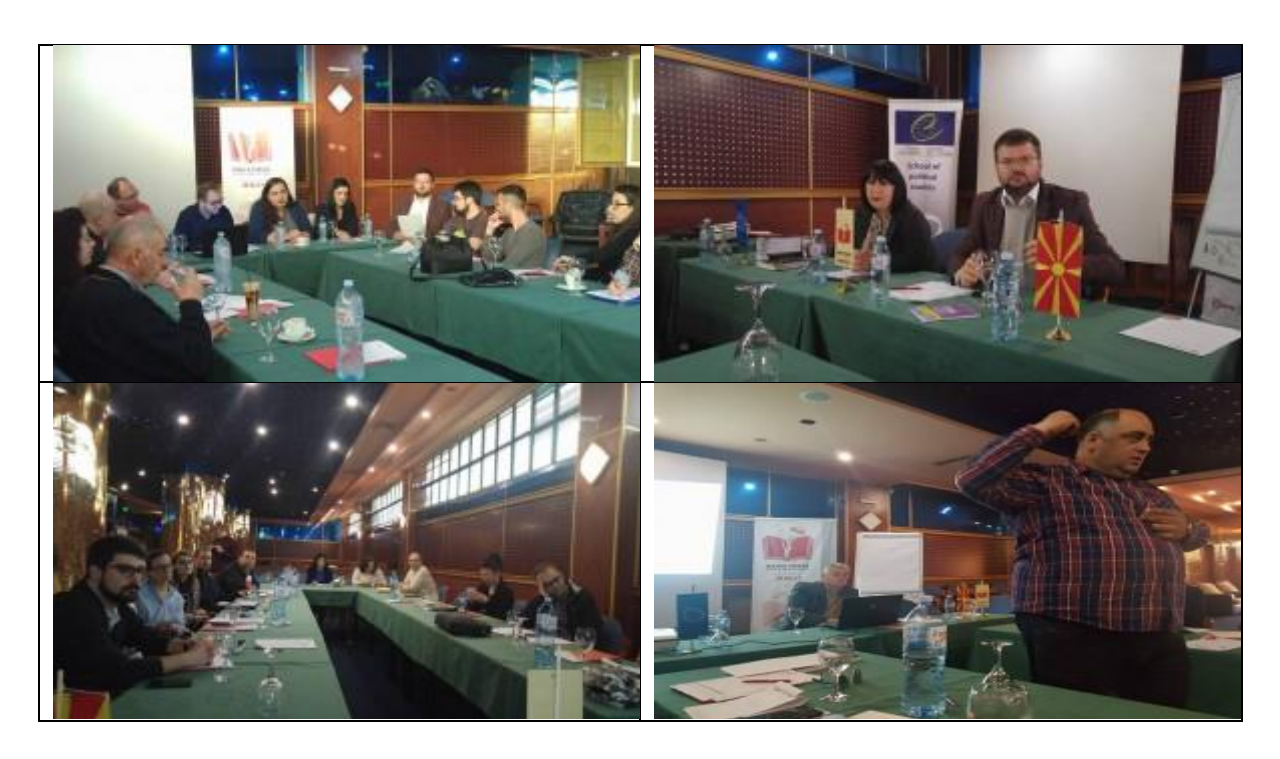
Second Session of School of Public Policy Mother Teresa, June 30-July 2, 2017, Hotel Belvi, Ohrid

students. The internet news in principle serves as a tool for greater visibility of the School's activities. A closed Facebook group also disseminates information on all School activities including on this seminar. A major risk for the Seminar and for the running of the School in general was/is the current political crisis in the Republic of Macedonia. The evaluations of the Seminar were very positive in terms of organization and similarly in terms of content and lectures involved