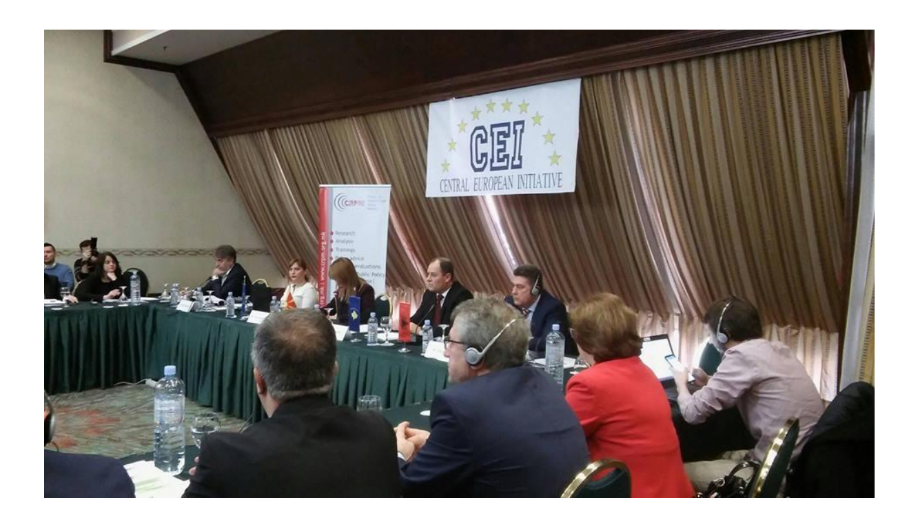
Enhancing Civil Society and Promoting Good Governance Principles Through Introducing Quality Management Systems in CSO

Project's overall objective is to contribute towards improvement of the civil society in Macedonia through promotion of the good governance principles which are embedded into tailor-made Quality Management System (QMS). The action will aim to introduce QMS as part of the organizational development, which will standardize management process for strengthening transparency, accountability and efficiency of the civil sector in Macedonia. The project was launched in April 2016, and will end in May 2018.