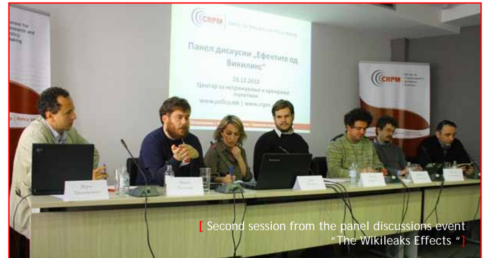
[ Second session from the panel discussions event “The Wikileaks Effects ” ]